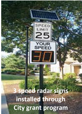
3 speed radar signs installed through City grant program