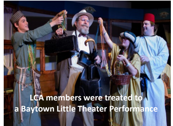
LCA members were treated to a Baytown Little Theater Performance