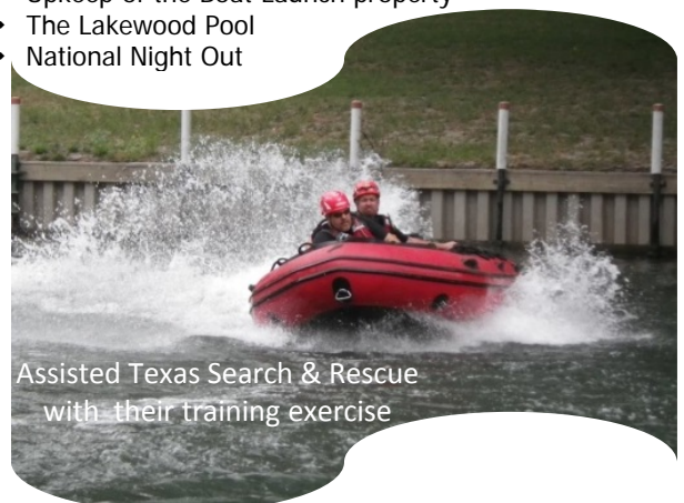
Assisted Texas Search & Rescue with their training exercise