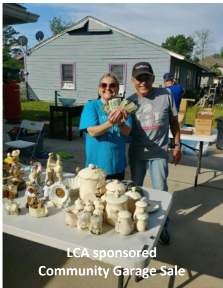
LCA sponsored Community Garage Sale