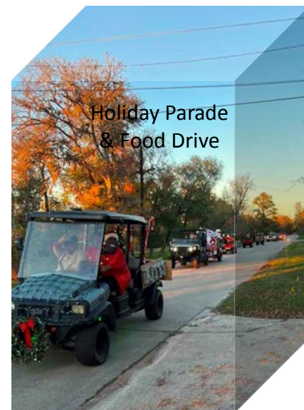
Holiday Parade & Food Drive